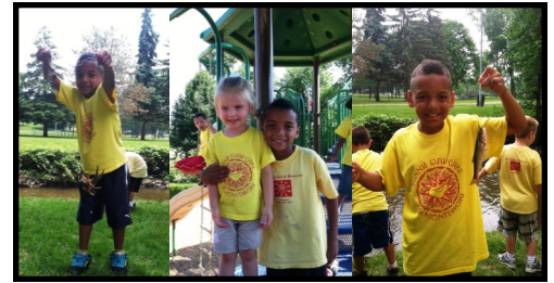
Fishing and Playing at Shiawassee Park