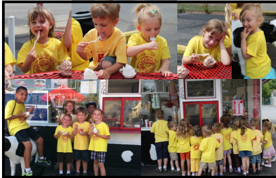
Two trips to the Silver Dairy