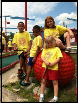
Putt 'n Fun